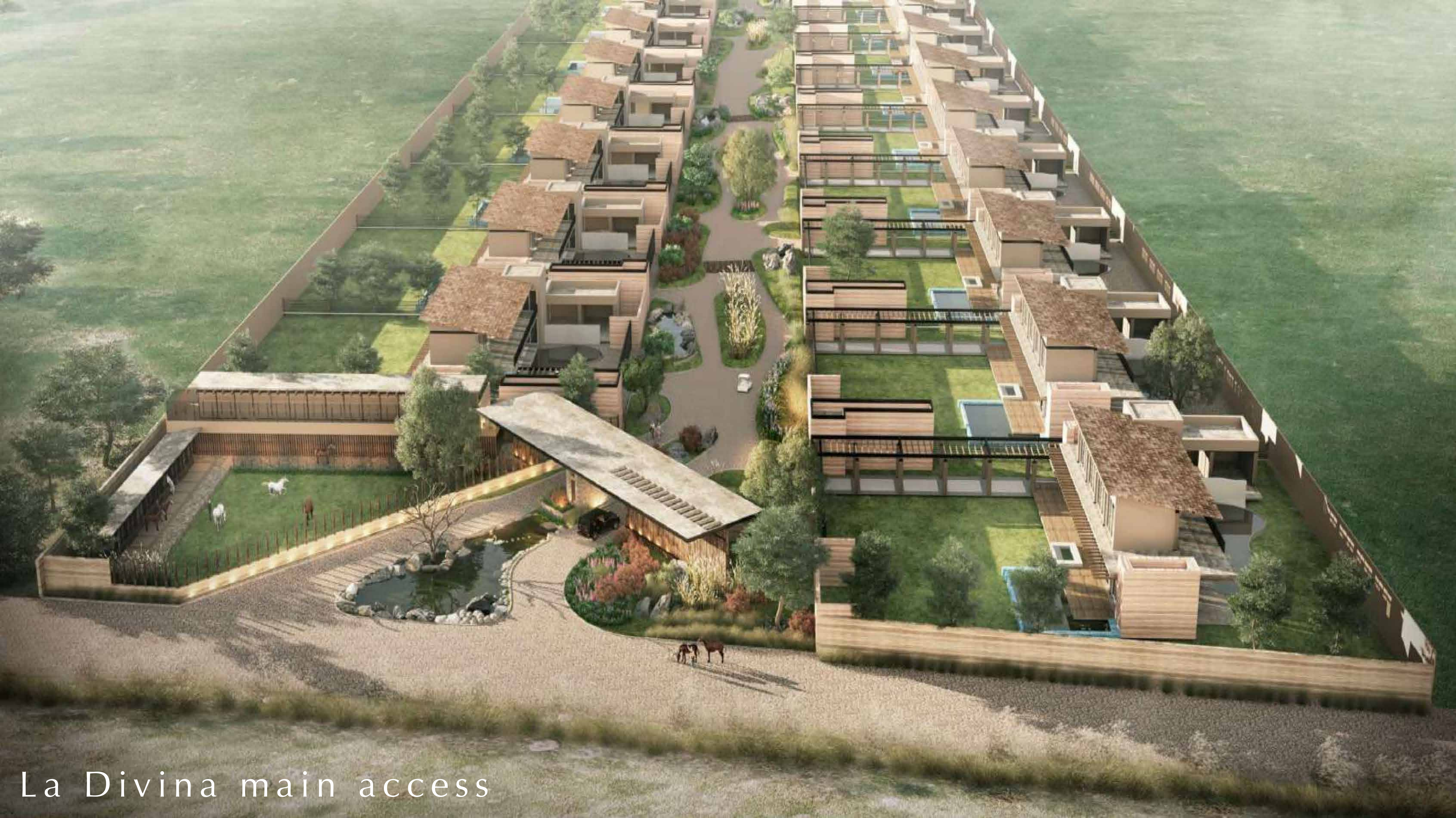
La Divina main access