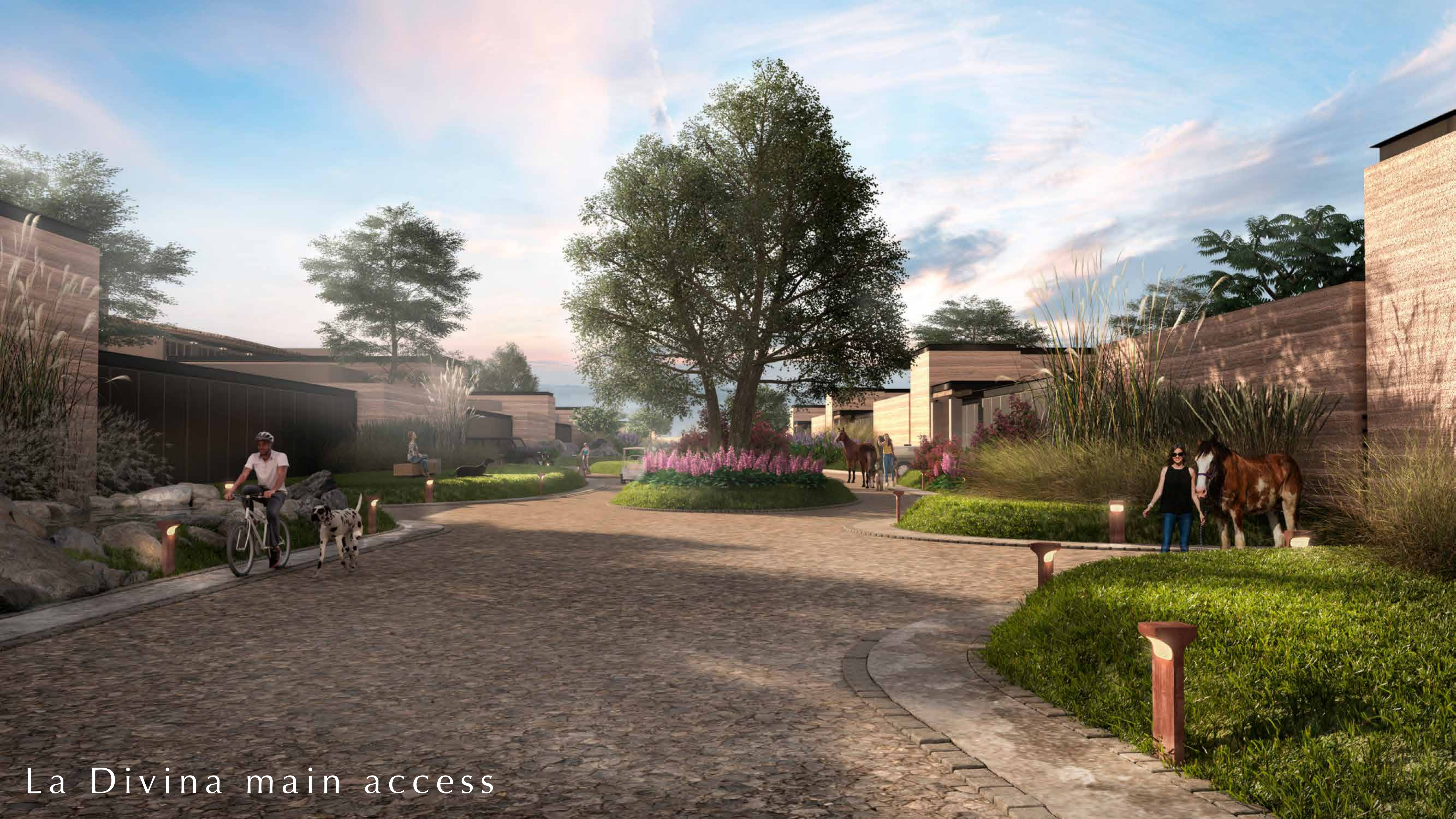
La Divina main access