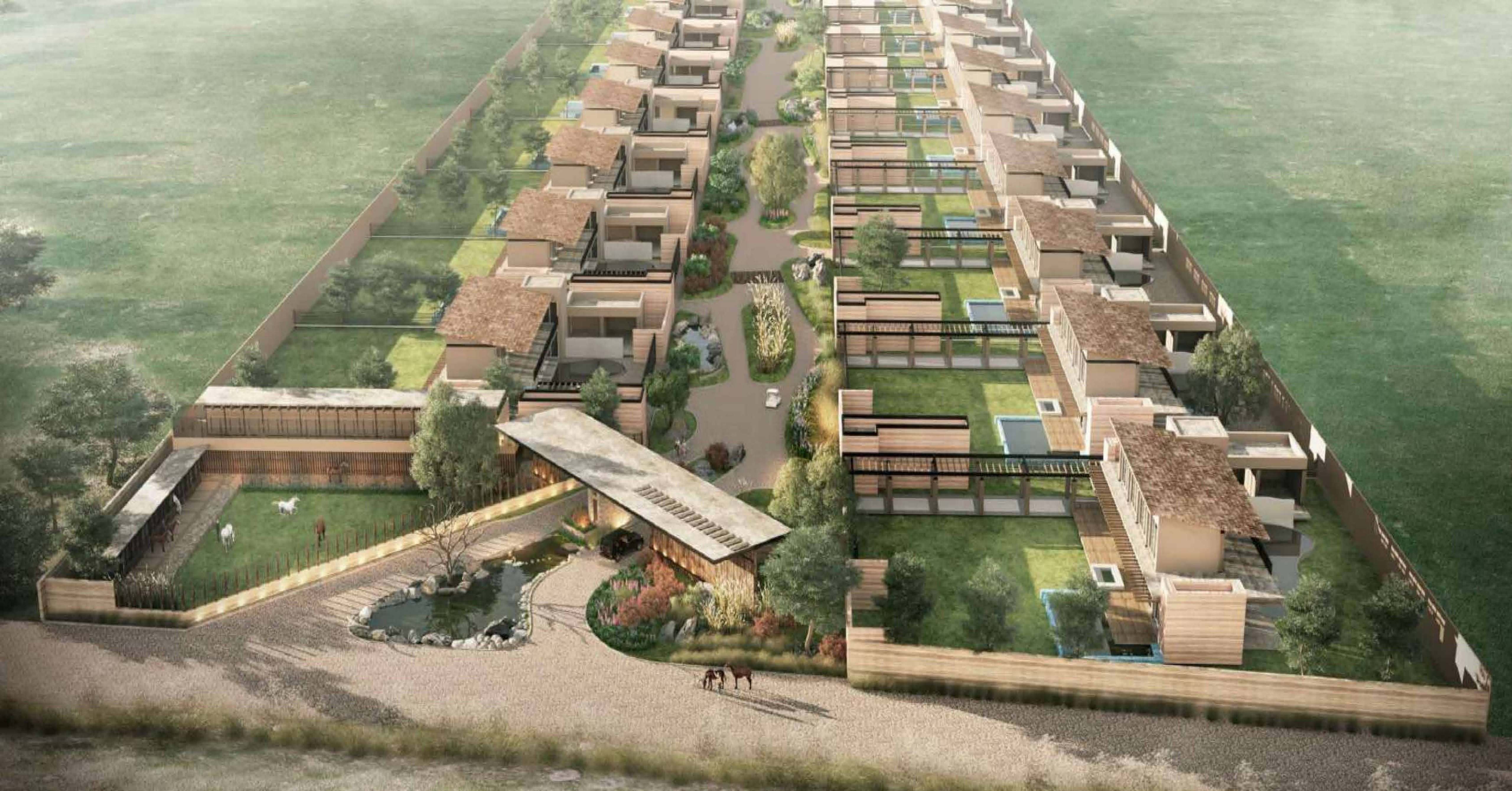
La Divina main access